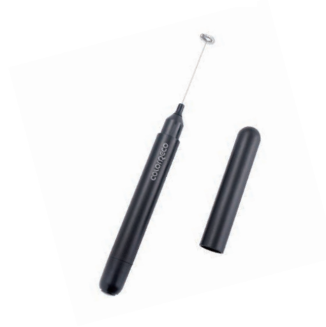
HBR-064 MILK FROTHER

76x76x182mm Battery: 7.4V/800mAh Materil: ABS, MS