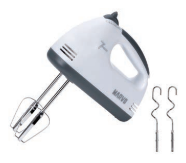
HBR-027 ELECTRIC HAND MIXER

Voltage: DC 7.4V (#18650, 3.7V*2 Lithium Ion Battery) Adaptor Input: 100-240Vac Adaptor Output: 5.0V Wattage: 200W Battery capacity: 2000mAh 2 Speed settings Glass bowl capacity: 1.2L Stainless steel 4-pieces blades With LED indicating lights