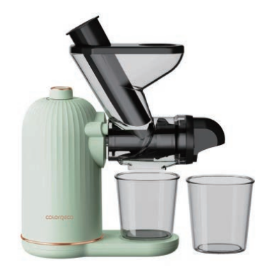
HYZ-002 MINI SLOW JUICER

160W copper motor Easy press die cast handle press with soft grip-stop Easy taking out and clean High juicing rate With anti-drip Stainless steel filter Non-slip rubber feet