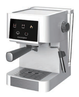
HCM-005 ESPRESSO COFFEE-MAKER

Power: 950W 20 Bar high pressure extraction coffee powder 1.5L transparent removable water tank Detachable frothing nozzle With 2 fiters for single & double cup Touch Screen Simple One Button Operation Overheat and over-pressure protection device Rotatable steam wand, Easy Frothing Separate drip tray, Easy to Clean