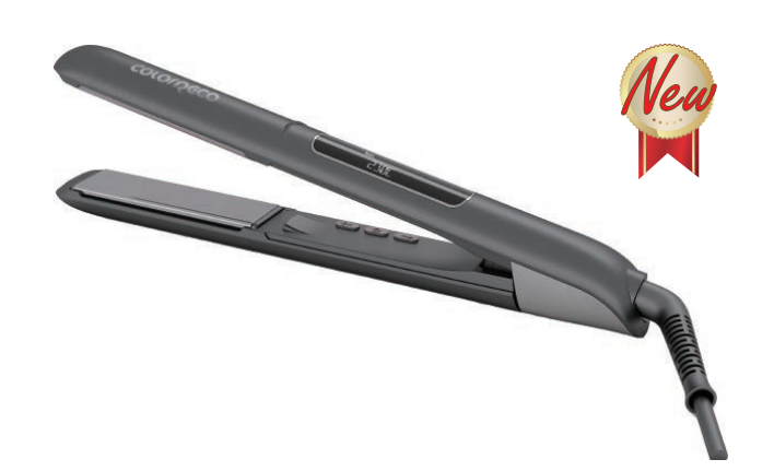
HC-085 HAIR STRAIGHTENER & CURLER

Voltage: 100-240V, 50-60Hz Power: 50W Temperature range: 100-230 Heat emitter material: PTC/MCH Ten million levels of negative ion hair protection (optional) Large screen HD LED digital display Straight volume dual-use 60 minutes automatic shutdown (customized)