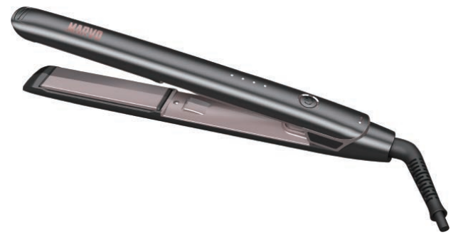
HC-001 HAIR STRAIGHTENER & CURLER

Voltage: 100-240V, 50-60Hz Power: 50W Temperature range: 100-230 Heat emitter material: PTC/MCH Ten million levels of negative ion hair protection (optional) Large screen HD LED digital display Straight volume dual-use 60 minutes automatic shutdown (customized)