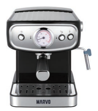
HCM-029 ESPRESSO COFFEE-MAKER

Power: 800W 1.2L transparent glass jar Anti-drip feature Programmable digital timer Keep warm function Non-stick warming plate Removable flter for easy cleaning Accessories: 1) Coffee powder spoon; 2) Re-usable flter