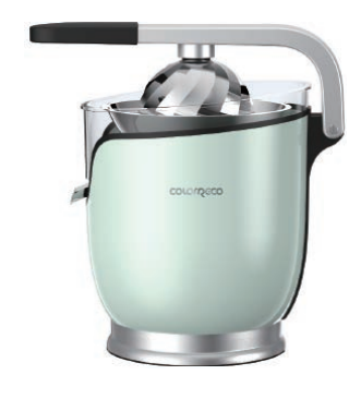
HYZ-003 JUICE EXTRACTOR

Motor: 5415 copper wire motor Power cord: 0.3 copper power cord Material: new food grade ABS Hardware: 430 material Function: Grinding Grinding bean capacity: 50g