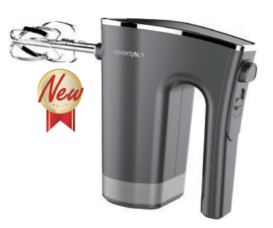
HBR-071 CORDLESS HAND MIXER

Voltage: DC7.4V (#18650, 3.7V*2 Lithium Ion Battery) Adaptor Input: 100-240Vac Adaptor Output: 5.0V Wattage: 80W Battery capacity: 2000mAh Charging time: 2-2.5 hours 3 speed settings