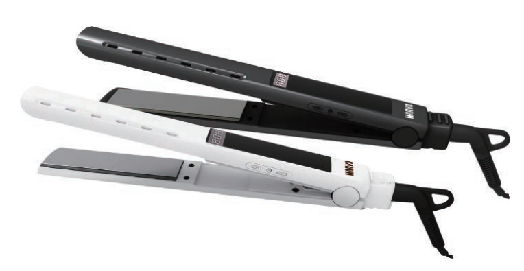
HC-046 HAIR STRAIGHTENER

Rated power: 44W Voltage: 100-240V, 50/60Hz 4-speed temperature control: 170-190-210-230 °C Ceramic coated heating plate size: 25x90 mm 1 hour automatic shutdown function LED temperature indicator Button lock function Negative ION technology 360-degree rotation wire PTC heater