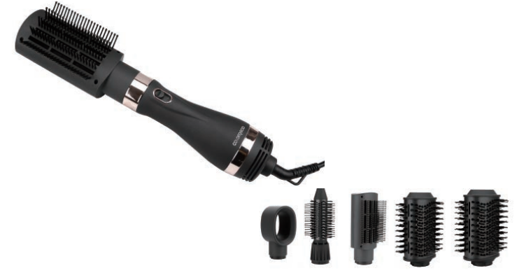
HC-092 MULTIFUNCTION HOT AIR BRUSH